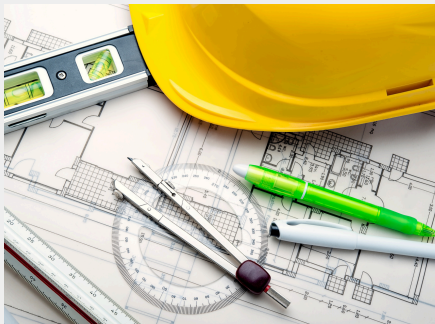
DESIGN & BUILD